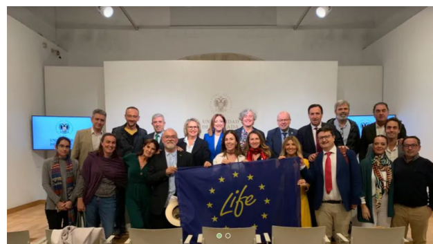
Fig 15. Attendees at the presentation of the Cívitas-UGR Chair in Sustainability