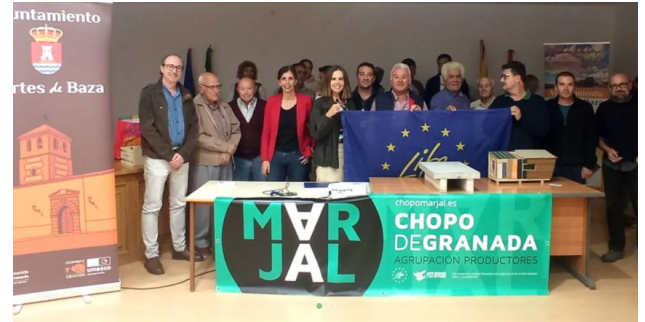
Fig 13. Members of the Granada Geopark pose with members of the LIFE project

The Geopark of Granada will promote poplar groves as a key economic, environmental and tourist resource in the development of this territory recognized by UNESCO for its geological and cultural values. In addition to the landscape value and timber wealth provided by this traditional crop, with a large presence in the fertile river basins of the regions of Guadix, Baza, Huéscar and Los Montes, poplar has important environmental benefits, thanks to its great ability to capture CO2 and pollution from the atmosphere, filter water polluted by agriculture, attract biodiversity, retain soil and cool the environment.