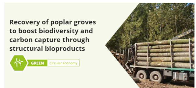
Fig 11. Cover page of the LIFE project advertisement on the Interreg website