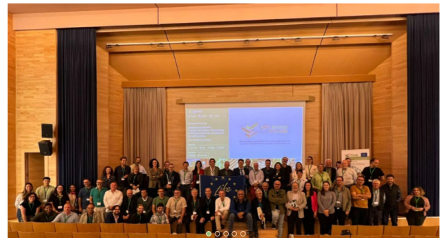
Fig 7. Participants in the conference on the use, industrial transformation and new uses of wood

growing demand for more sustainable solutions that allow the industrialization of the entire construction process. Wood, a biologically based material with extraordinary mechanical and numerically controlled machining properties, is today considered the most appropriate material for this transformation in the sector.