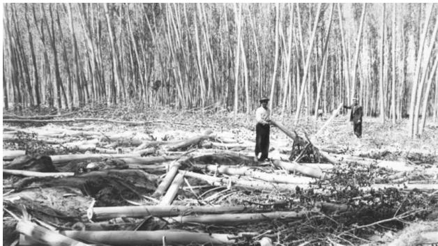
Fig 3. Poplar cutting in the 1980s

They were key to the development of other crops that allowed the province to grow, such as sugar beet and tobacco. Now they are a sure value, with guaranteed environmental benefits.