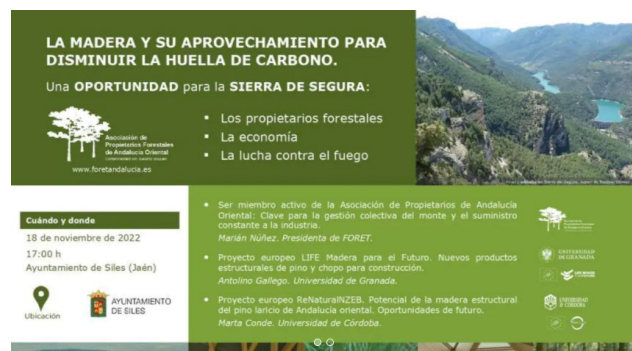
Fig 14. Cover of the presentation in Siles of the economic development project for the region

Sierra de Segura , presented to forest owners and other social and economic agents a sustainable development project for this region, which includes municipalities in the provinces of Jaen and Granada.