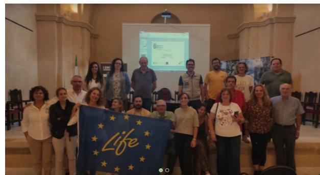
Fig 9. Members of the LIFE project at the meeting held at the Interpretation Centre of Sierra Morena-Santa Ana (Guadalcanal)

The Provincial Council of Granada, as part of the First Meeting of Andalusian Geoparks, gives a talk entitled “European projects in the Geopark territories of Andalusia”, which aims to encourage the different geopark territories to participate in the presentation of projects with EU funding.