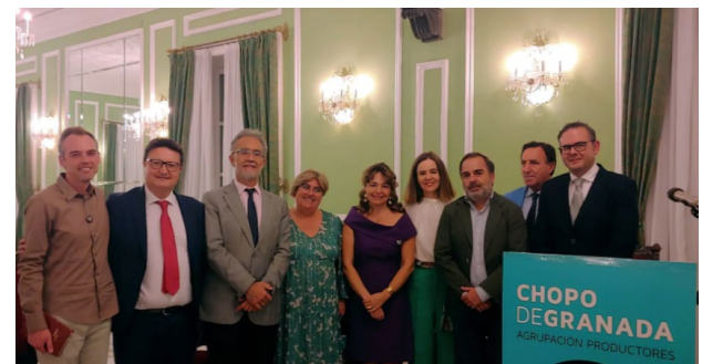
Fig 6. Poplar producers organise Granada's first-ever timber auction

The Marjal association was presented last Thursday at the Carmen de los Mártires to representatives of the City of Granada, the Andalusian Government, the Provincial Council and the University.