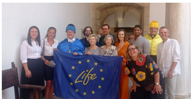
Fig 1. Members of the LIFE project at the opening ceremony of the academic year.

The coordinator of the LIFE Wood for Future project gave the inaugural lecture at the opening ceremony of the 2022-2023 academic year on Saturday, September 10, 2022, at the Royal Hospital, headquarters of the Rectorate.