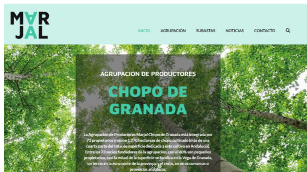
Fig 5. Front page of the Marjal Association website

Marjal, the Association of Poplar Producers of Granada, now has a website.