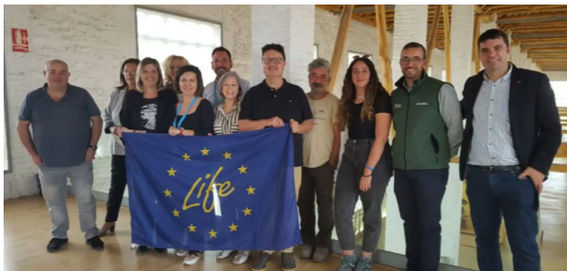
Fig 10. Participants in the European Heritage Days pose with the LIFE flag

The town hall of Vegas del Genil in the Vega of Granada hosted yesterday October 21 the Forum Meeting of Experiences within the European Heritage Days organized by the Territorial Delegation of the Ministry of Tourism, Culture and Sport of the Andalusian Government.