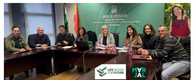
Fig 18. Members participating in the meeting with the new Delegate of Agriculture