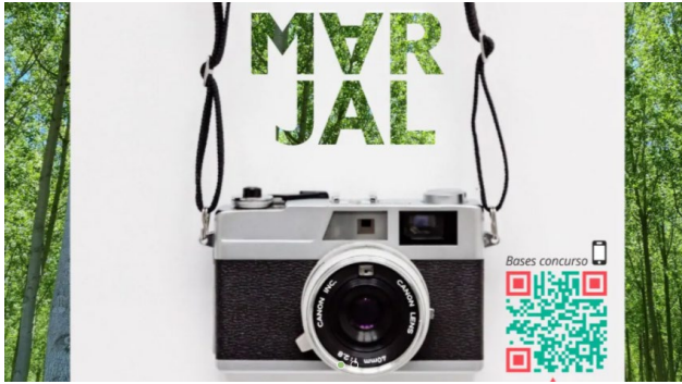
Fig 12. Poster of the competition with QR linked to the rules