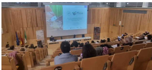
Fig 17. Presentation of the participation of the LIFE WOOD FOR FUTURE project in the IMPRONTA project Granada

The IMPRONTA Granada project starts its activity with a series of innovation and co-creation laboratories, in which the challenges of climate change in Granada have been addressed.