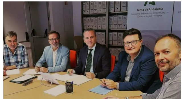
Fig 4. General Director of AVRA poses with representatives of the UGR and the ETSIE

On September 23rd, an interesting and profitable meeting was held between AVRA (Department of Housing, Territorial Coordination and Housing) and the University of Granada (UGR) in the framework of the LIFE Wood for Future project.