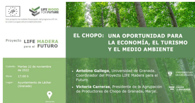
Fig 16. Front page presentation of the LIFE WOOD FOR FUTURE project in Láchar

need to group, the sale of carbon credits, and the development of new products to value the wood from their plantations.