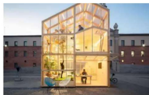
ACTIVIDADES Ejecución del proyecto piloto Nueva Bauhaus basada en la industria de los laminados estructurales de madera de chopo.