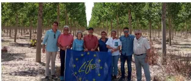
Fig 5. Attendees at the field day in the poplar plantations along the Genil River in Ecija

As part of the replicability and transfer of results at the level of demonstration plantations, several owners met with the owners of Agrícola Genil in Écija for a field day in the poplar plantations next to the Genil river in this Sevillian town.