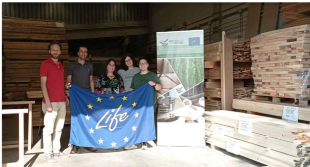
Fig 16. Members of the LIFE project generating synergies with the Municipal Chamber of Évora

Networking day between the projects LIFE Água da Prata and LIFE EcoTimberCell and LIFE Wood for Future , taking advantage of the visit of the environmental technician of the City Council of Évora to the PEMADE facilities at the Campus Terra of the University of Santiago de Compostela.