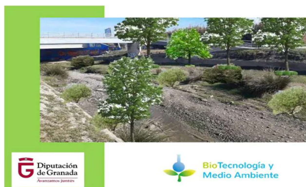
Fig 12. Cover of the presentation meeting of the Río Dílar restoration project

The company Biotecnología y Medioambiente S.L., through a meeting convened by the Diputación de Granada, has presented the project for the restoration of a 12 km stretch of the Dílar river from Gójar to Vegas del Genil.