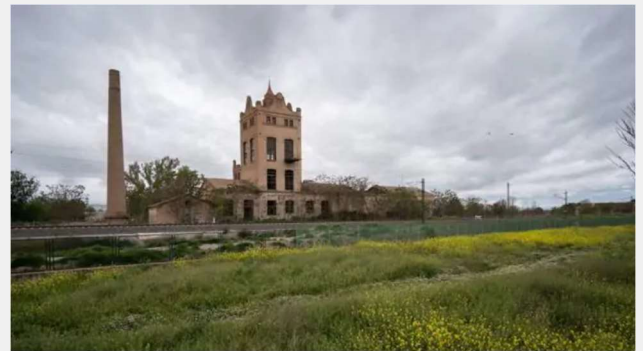
Fig 15. Azucarera de San Isidro

LIFE Wood for Future researchers will be the first to be installed in the new spaces of the BIC industrial building of the San Isidro Sugar Factory .