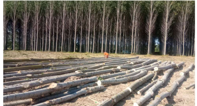
Fig 17. Timbers harvested for poplar structural timber certification.

two in the Duero Basin (Remolinos in Zaragoza and Marcilla in Navarra).