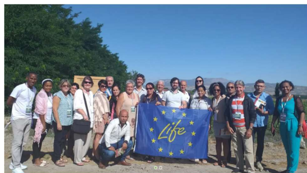
Fig 11. Visit of the Ibero-American Union of Municipalities to the poplar mother stock field planted in the provincial nursery of the Diputación de Granada.

The Ibero-American Union of Municipalists has visited the field of poplar mother vines planted in the provincial nursery of the Diputación de Granada, as part of its INTERNATIONAL TECHNICAL MISSION "SOCIAL