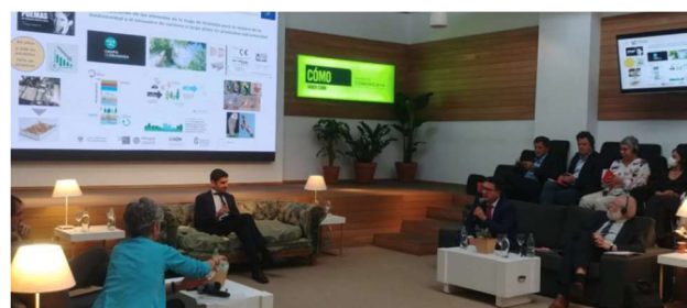
Fig 7. Treeconomics, Timber and Sustainable Economy Conference