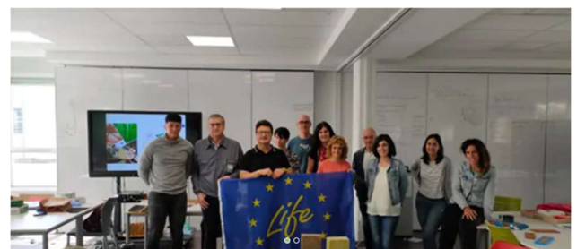
Fig 6. LIFE Wood for Future at ERAIKEN Vocational Training in the Basque Country