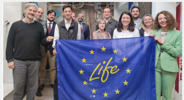
Fig 2. Participation of the LIFE project in the conference on best practices in circular economy in the construction sector organized by the City Council of Granada.

The LIFE Wood for Future project has participated on 29 th April 2022 in the day of good practices in circular economy in the construction sector organized by the City Council of Granada through the European project URBACT URGE, in the Official College of