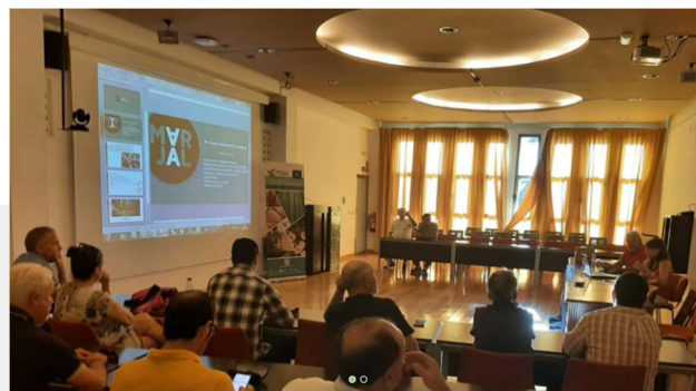
Fig 19. Sixth meeting of the Poplar Growers' Group (Action C1-E1)