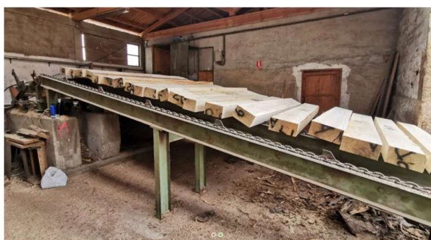
Fig 18. Sawmill Madera Pinosoria S.L.

Promoting the adoption of this model among rural businesses is a priority for the development of different European Union policies in an attempt to conserve the natural environment, stimulate business innovation and create stable employment in the rural world.