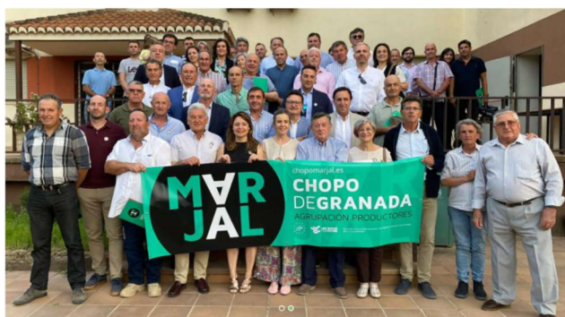
Fig 3. Members of the Agrupación Marjal pose after the election of the new board of directors.

A total of 73 Andalusian landowners, the vast majority of them from Granada, signed the past Saturday 16 th of May the founding act of the Agrupación de Productores Marjal Chopo de Granada , which brings together 1,270 hectares of this tree crop, under LIFE Wood for Future/Madera para el Futuro (LWFF), the project led by the University of Granada and funded by the European Union within its financial strategy for action against climate change.